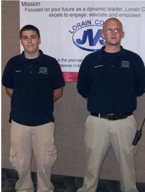
Law Enforcement students are on the job patrolling the building.