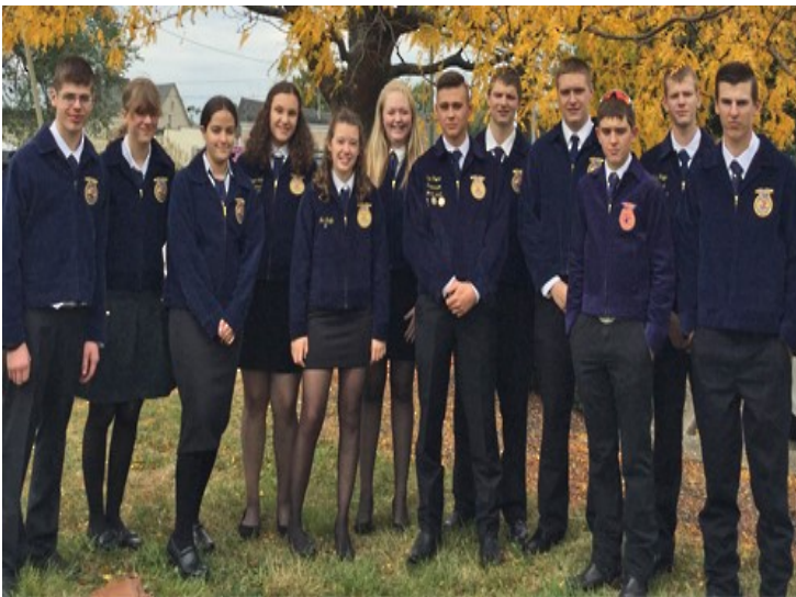
Landscape & Greenhouse Management and Industrial Equipment Mechanics students attended the FFA National Convention in Columbus.