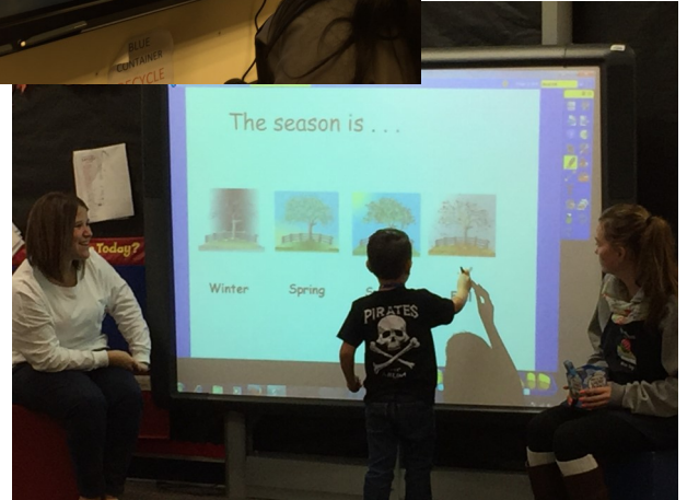
Early Childhood Education